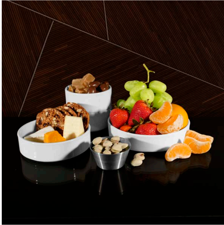
Puddifoot Stacking Dishes