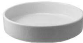
Stacking Tapas Dish

Diameter 6" | 15 cm Capacity 10 oz | 284 ml